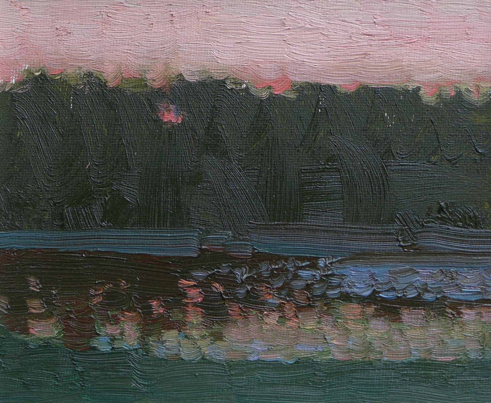
“Pink Night”. Canvas on cardboard, oil, 17 x 20 cm, 2007