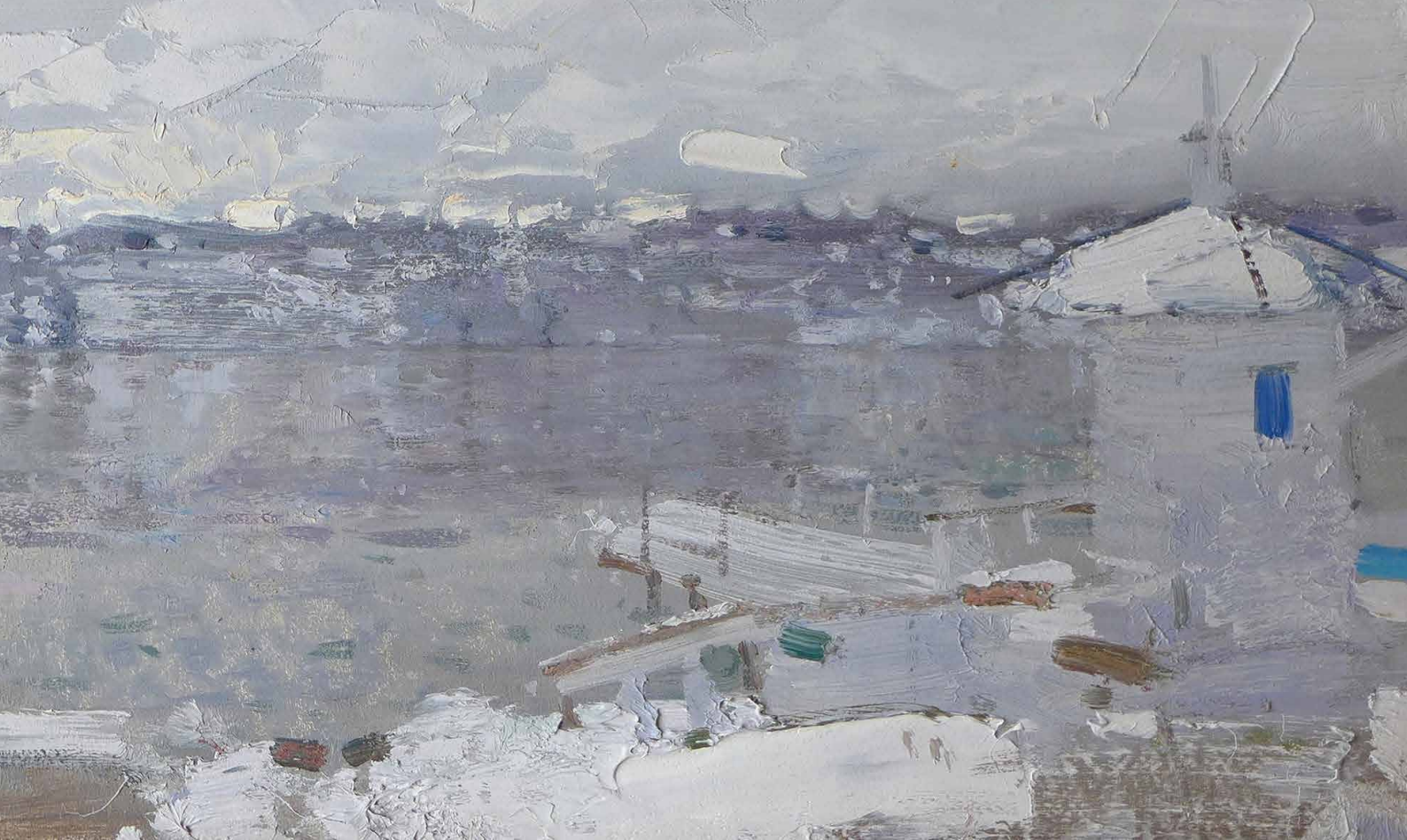
“First Snow. Ples“. Cardboard, oil, 15 x 25 cm, 2013