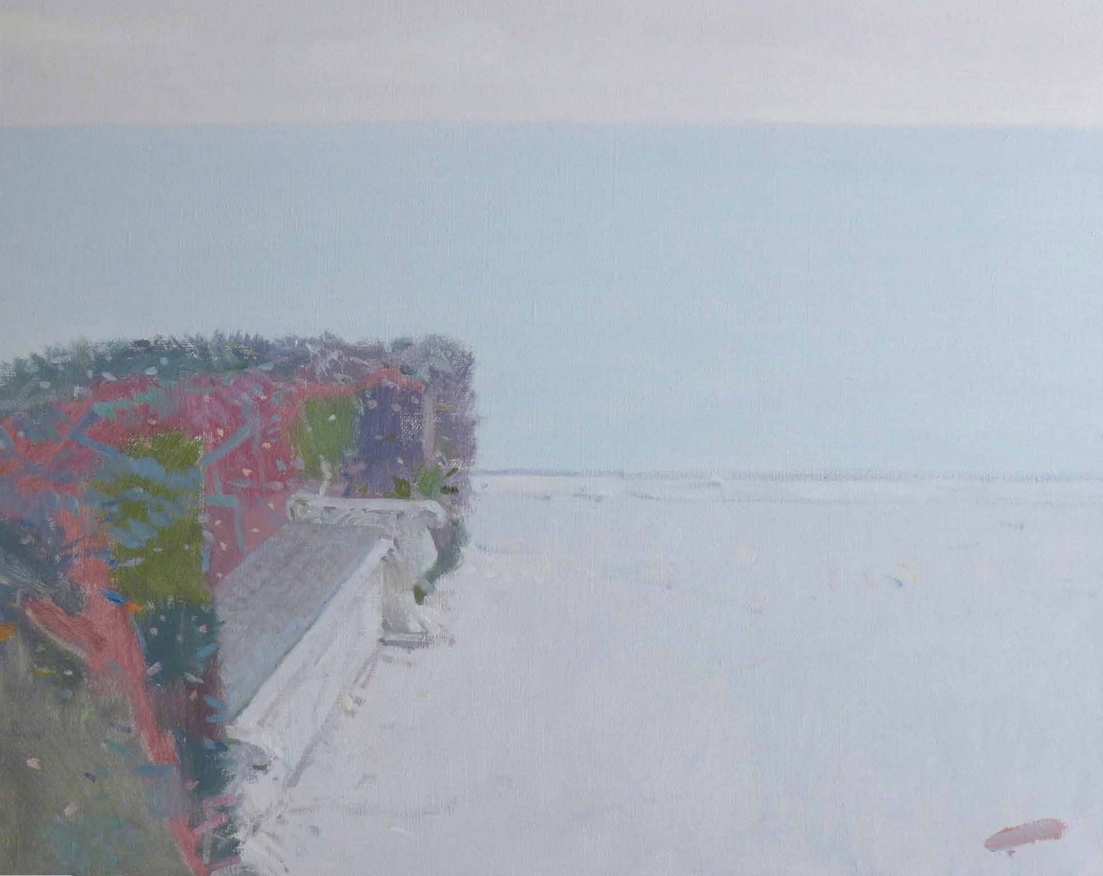
“Terrace”. Oil on canvas, 40 x 50 cm, 2015