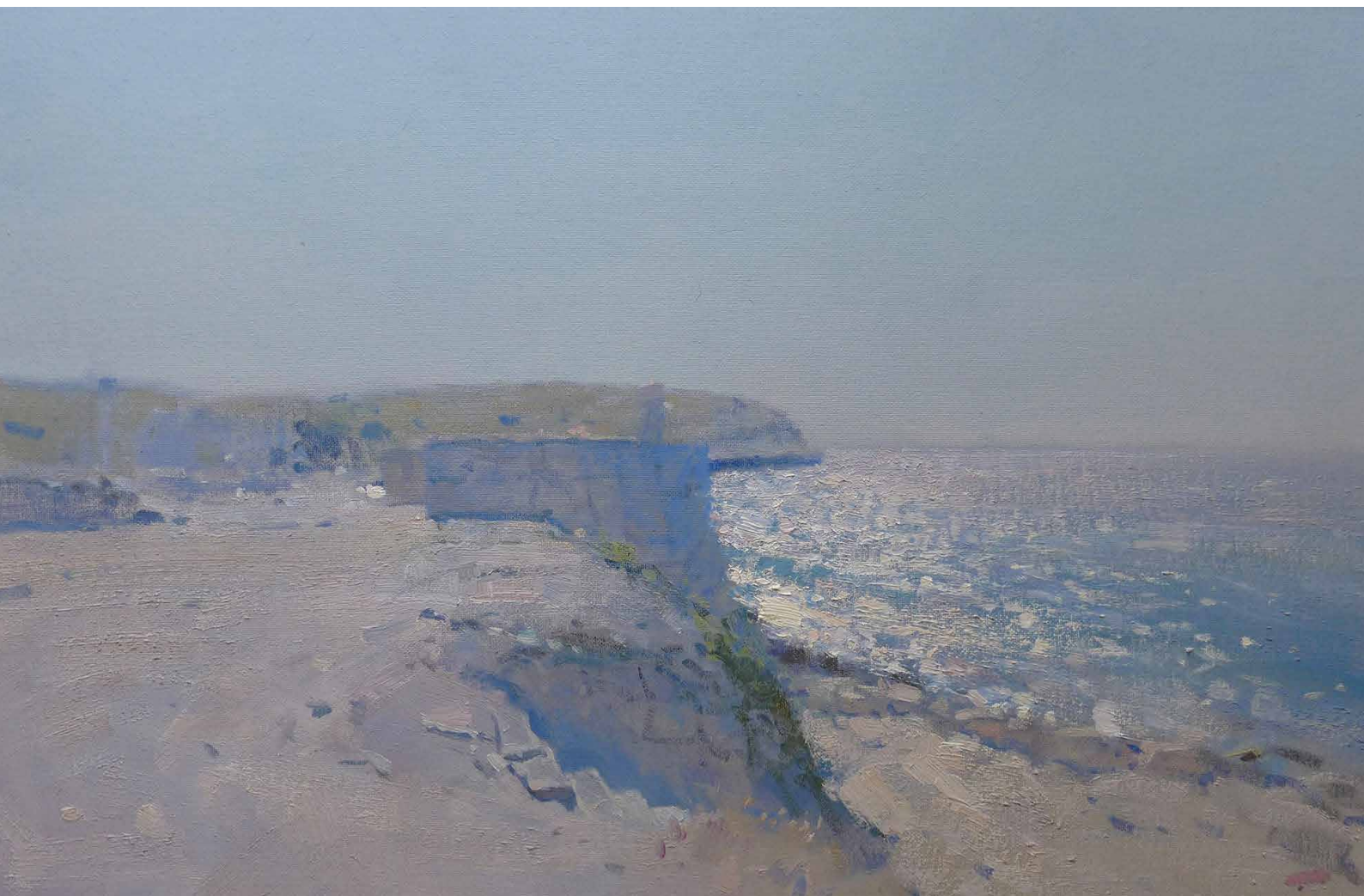
“Hersonissos“. Canvas on cardboard, oil, 40 x 60 cm, 2015